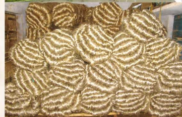
Pic. 2. Improved retting with microbial formulation and the resultant golden fibre