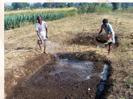
Pic. 4. Sisal waste is a promising source of organic manure to arrest carbon depletion in the drier tracts of India