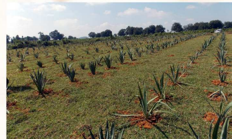
Pic. 3. Vast fallow land mass in the central plateau region of India turned green by sisal plantation