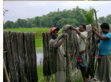
Pic. 1. Conventional method of retting and resultant black coloured fibre